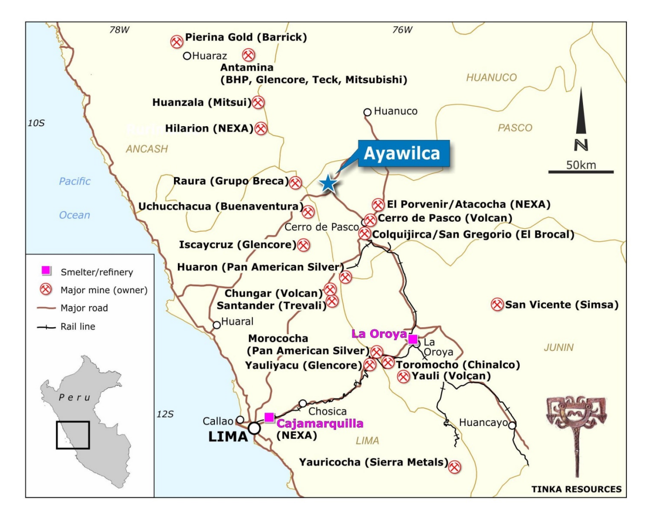
NI 43-101 Technical Report on the Mineral Resource Estimate for the Ayawilca Property, Department of Pasco, Peru

The Company currently has one material property for the purposes of NI 43-101. The property, known as the Ayawilca Property, located 40 km from Peru's largest historic zinc mine, Cerro de Pasco, in central Peru, consists of three separate mineral zones: the Ayawilca Zinc Zone (zinc-indium-silver-lead); the Ayawilca Tin Zone (tin-copper-silver); and the Colquipucro silver oxide deposit. The map below shows the location of the Ayawilca Property.